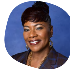
Dr. Bernice A. King